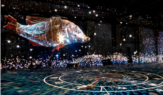
Franz Fischnaller: THE GREAT CIRCLE , 2022 immersive multimedia installation, installation view KUNSTKRAFTWERK Leipzig

The immersive multimedia installation THE GREAT CIRCLE (2022) is a digital composition designed by new media artist Franz Fischnaller and an homage to Tübke's monumental work. Selected scenes from his panorama about the German Peasant Wars glide across the walls of the machine hall of the KUNSTKRAFTWERK in Leipzig. These are accompanied by sound effects created by Steve Bryson , which make the figures of the painting come alive and turn the visitors themselves into participants in the 360° scenario.