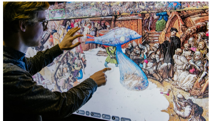
Centrica: TÜBKE TOUCH , 2021 cloud based ArtCentrica application © KUNSTKRAFTWERK, 2022, photo: Luca Migliore

TÜBKE TOUCH is a cloud application developed by Centrica for digital art education. Using a touchscreen, whiteboard, or computer screen, one is able to look at Tübke's image as a whole and also zoom into specific details. Different viewing options, for example by theme, entail additional information. TÜBKE TOUCH offers an immediate and intensive exploration of the work of art, which is almost impossible to grasp in its original format due to its immense size and the multiplicity of figures it entails.