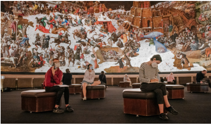
Werner Tübke: Frühbürgerliche Revolution in Deutschland , 1983/87 oil on canvas, 14 x 123 m, installation view, Panorama Museum, Bad Frankenhausen

The PANORAMA MUSEUM was built specifically for Werner Tübke's (1929 – 2004) monumental panorama painting Frühbürgerliche Revolution in Deutschland (Early Bourgeois Revolution in Germany, 1983/87). The 1,700 square-meter painting, one of the largest paintings in the world, is still on view here. The colossal project was commissioned by the GDR government, which decided in the early 1970s to erect a monument for the German Peasant Wars on the Schlachtberg at Bad Frankenhausen. The museum opened in 1989, shortly before the Peaceful Revolution.