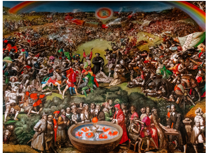
Werner Tübke: Frühbürgerliche Revolution in Deutschland , 1983/87 oil on canvas, 14 x 123 m, installation view, Panorama Museum, Bad Frankenhausen

An immersive light and sound installation in the form of a 27-minute presentation was developed for the spaces of the KUNSTKRAFTWERK out of the high-resolution images taken by Centrica . A stunning composition of images and sounds was developed around Werner Tübke's epic painting about the German Peasant Wars. It was created under the direction